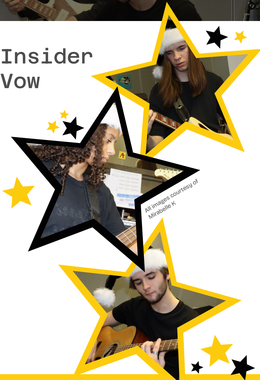
All images courtesy of Mirabelle K